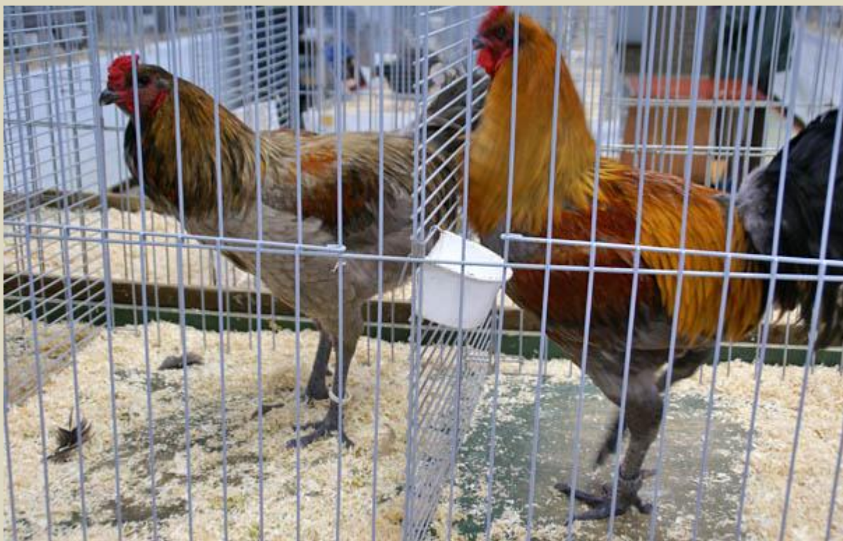
Above: Liege Game.