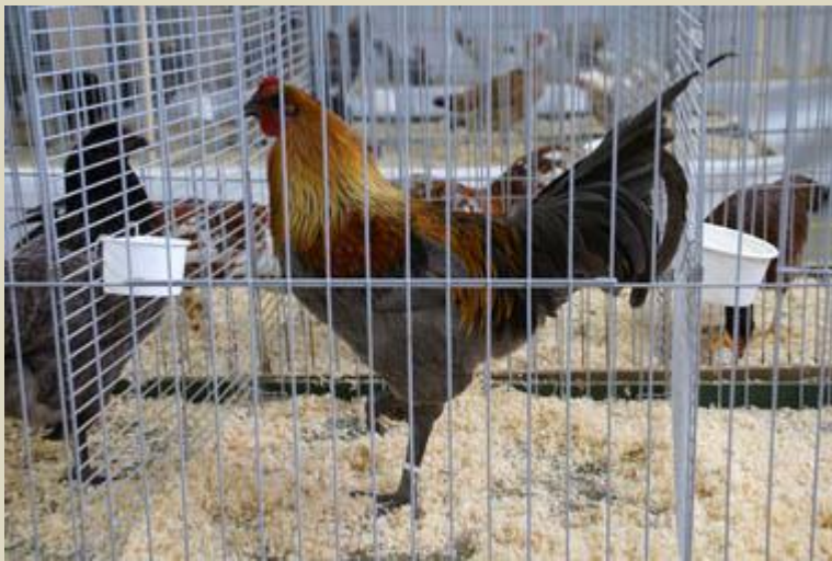
Left: Bruges Game bantam. Below: Liege Game bantam.