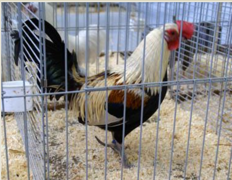
Left: Old English Game cockbird. (A real old one!) Below: Orloff cockbird.

Regarding the Old English Game bantams, 40 entries in total. These were of very good quality. The best one was exhibited by Mr. D. Rüppel from Germany (the organizer of the German Open Champion Show) showing a brassy back Old English Game bantam cockbird.