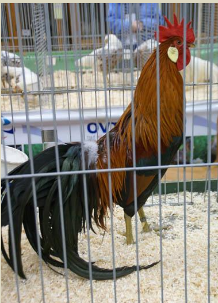
Above: Koeyoshi rooster. Left: Totenko rooster.