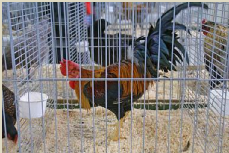
Below: Bergische Kräher rooster.