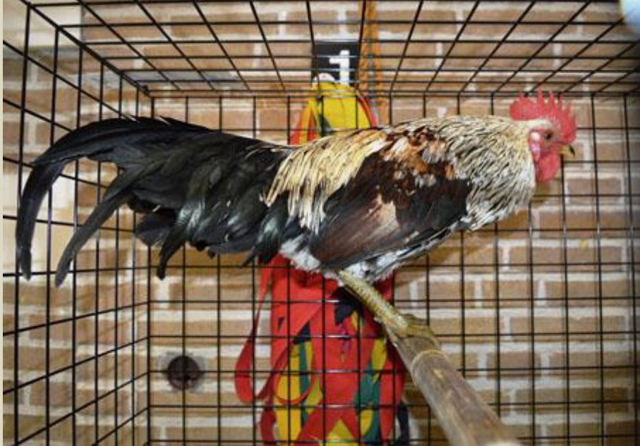
Left: The laughing Indonesian Ayam Ketawa.